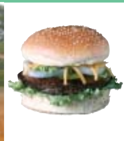
Ruby Tuesday burger