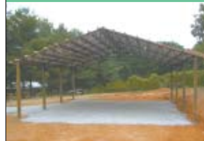
New Hispanic ministry pavillion