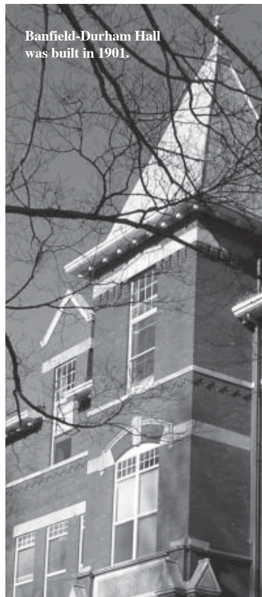
Banfield-Durham Hall was built in 1901.