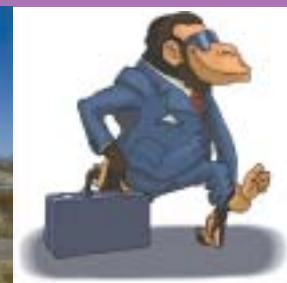
Scopes Monkey Trial