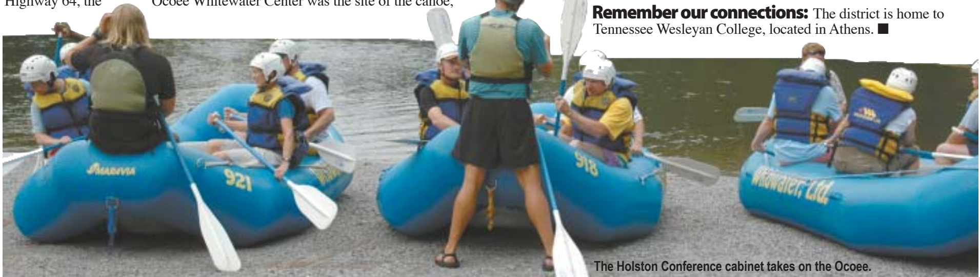
The Holston Conference cabinet takes on the Ocoee.

Scopes and floats: Go get your shorts wet with Ocoee River whitewater rafting or kayaking, a huge tourist draw in the area. Located in Ducktown on Highway 64, the Ocoee Whitewater Center was the site of the canoe,