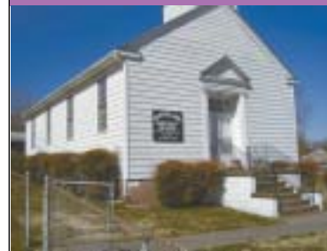
A recycled district office