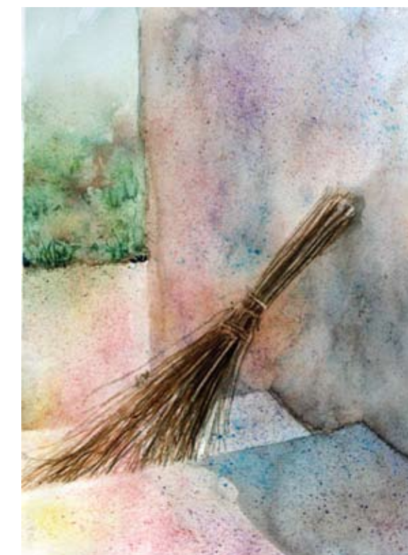
PAINTING AT RIGHT – Dust to Dust. The image "reminded me that we can find beauty in things as simple as a homemade broom," Gass blogs.