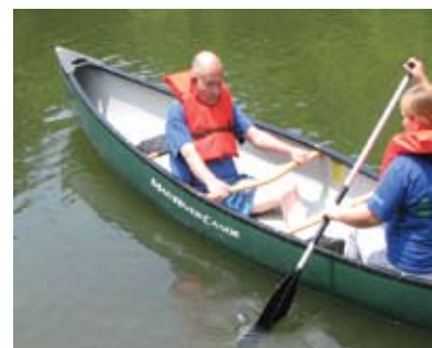
About half of the mentally challenged adults attending Celebration Camp at Buffalo Mountain are over age 65.