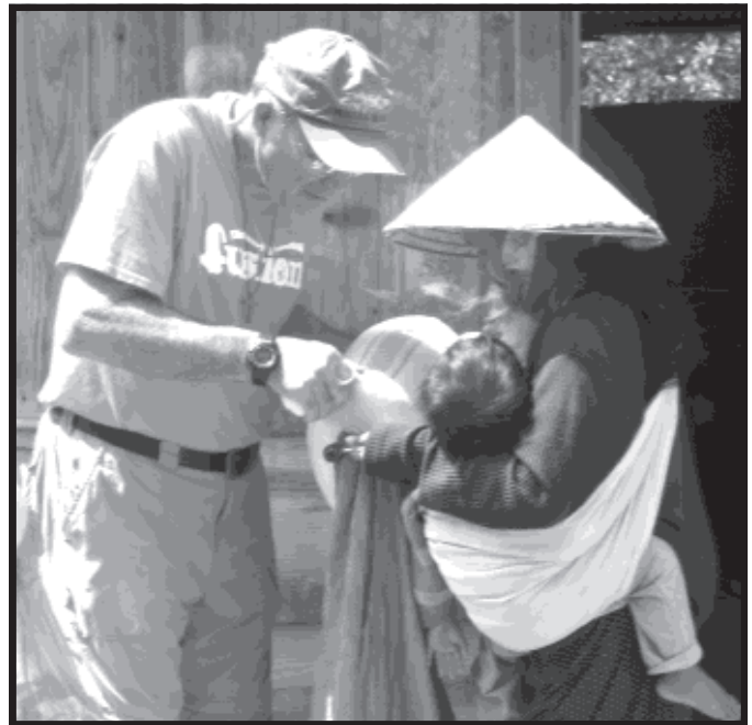
Holston Project No.